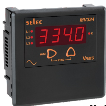
96 x 96 mm